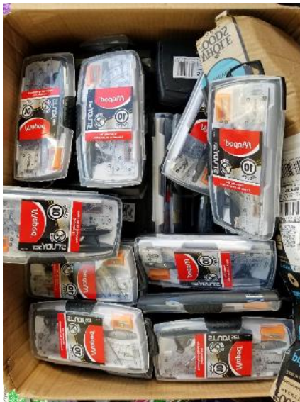
100 10-Piece Geometry Sets