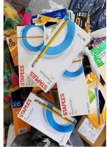
Composition Notebooks, 3- and 5-Subject Notebooks, Pens, Pencils, Markers