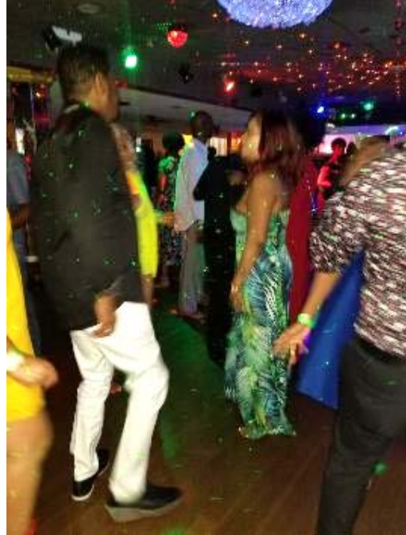
Supporters having a good time!