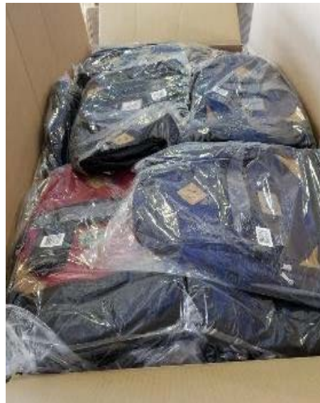
96 Back Packs